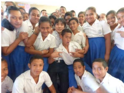
Where is the teacher? (Salailua P/S)