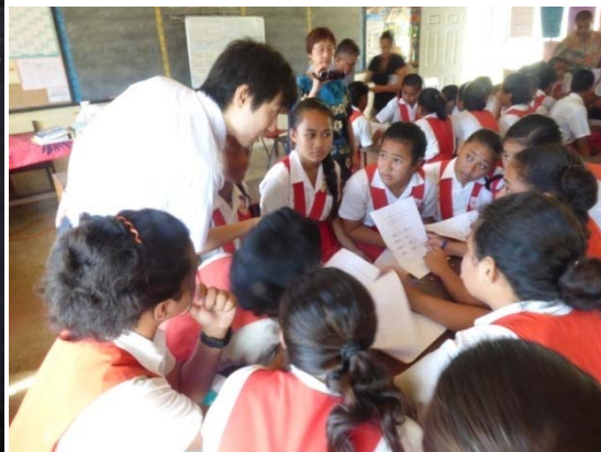
Vaigaga Primary School