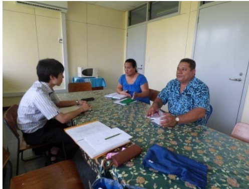
At NUS Staff Room

We visited NUS to talk with a Mathematics lecturer. We exchanged views concerning the way to do the pre-service teachers' training, the PMSP lesson plans and the necessity of students 'textbooks for primary education.