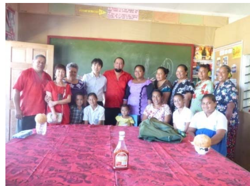
PMSP team and school staff