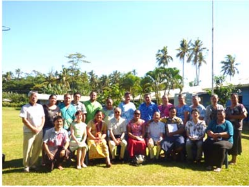
@ Saina P/S