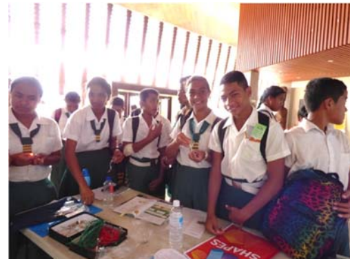
College students enjoyed lighting up the miniature bulb at the MESC.