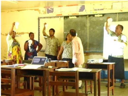
"I can light up the miniature bulb."

Eleven teachers including the school principal attended this course.