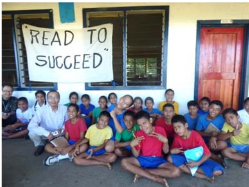
The pilot school students with the experts at Savai'I Island

Finally the PMSP team had the promotion activity at the MESC on July 23 & 24 as part of the program for the National Literacy Week. More than 100 Primary and College students visited our corner and enjoyed the simple science experiment and mathematics quiz.