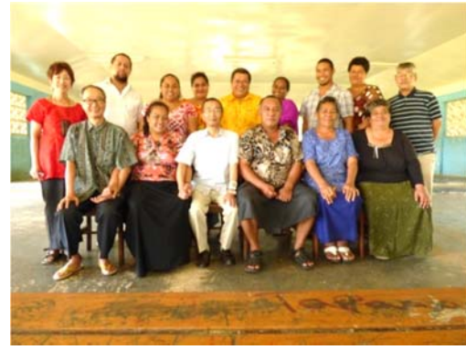
@ Falefitu P/S

The PMSP team visited Savai'i Island on July 10 th . The students were preparing for the national literacy week.