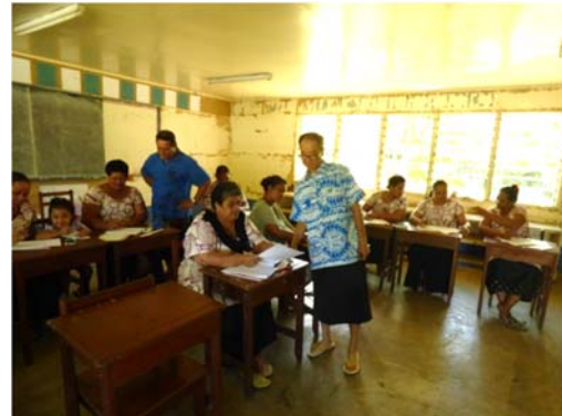
"Oh, it's difficult to find the area."