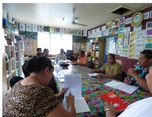
Review Meeting (earnest discussion)