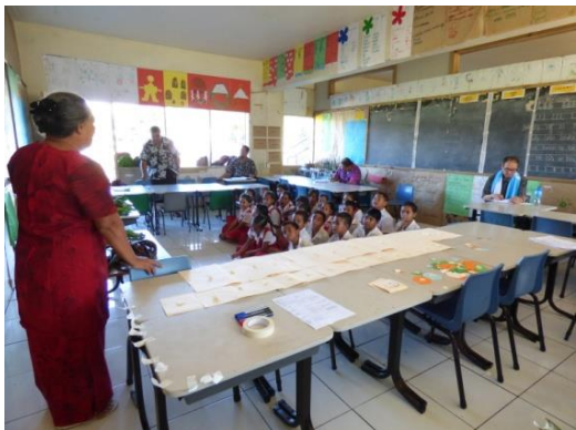
Year 3 class (many resources)

This meeting is very important for teachers to improve the class.