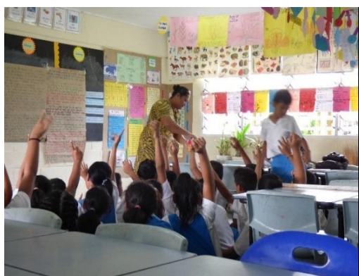
Year 6 (active students)