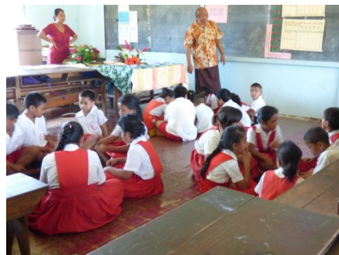
Year 5 (group activity)