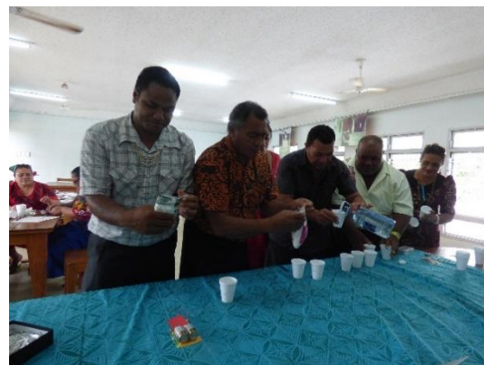
Teachers are happy to do the experiment.