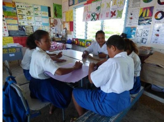
Discussion by group