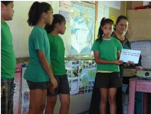
Y8 students' presentation