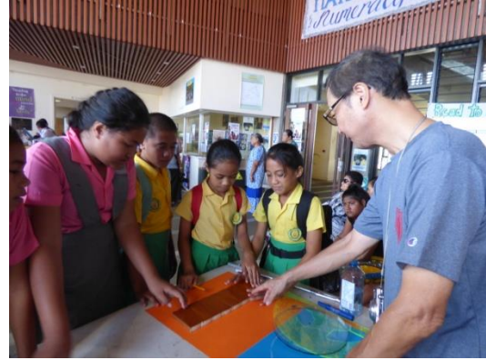
National Literacy & Numeracy Week at MESC