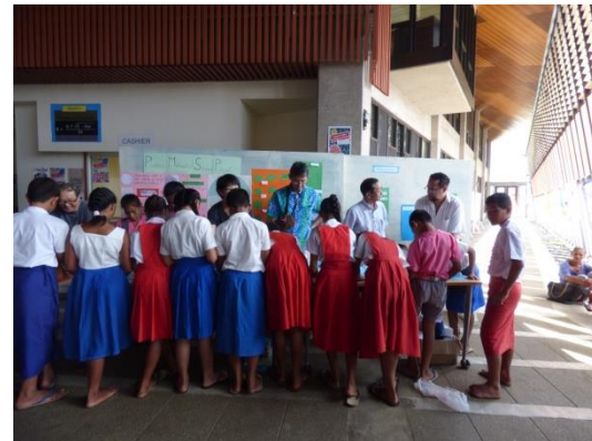
College students are interested in solar cars.