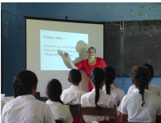
PPT is good for students to understand clearly.