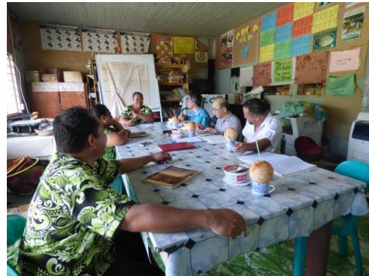
Review meeting after the lesson