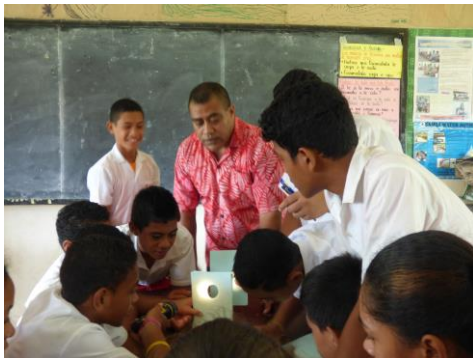
JICA team observed a lesson presentation.

I hope that the JICA Evaluation Team has a good impression of the PMSP successes. Most interviewees told the JICA team that PMSP is valuable and had been a great help to Samoan teachers and there is a big change in students' motivation after PMSP. PMSP lesson plan has been adopted by all the pilot schools.