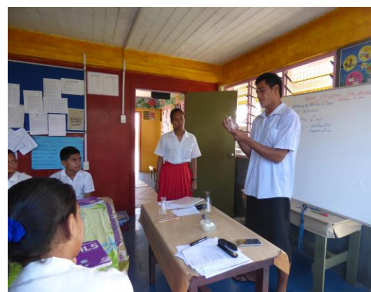
Students enjoyed an experiment.

A project evaluation team came to Samoa from JICA Hokkaido.