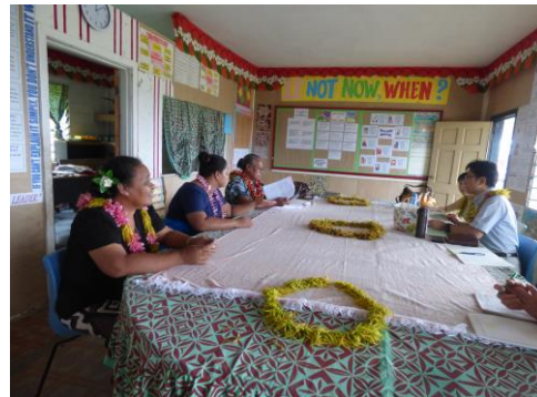
Hearing by JICA Hokkaido staff