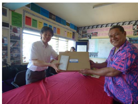
left: Y 6 Math lesson right: Gifts: Handy white boards and liquid crystal thermometers

After schools visits, they paid a courtesy call to CEO, MESC and presented a beautiful Japanese fan for the friendship between MESC and HUE.